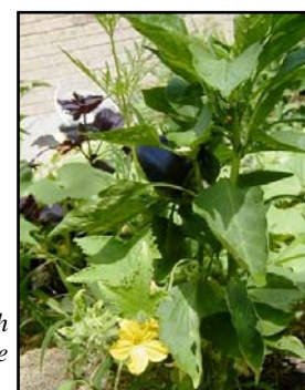
Chocolate bell pepper and squash blossom. Marilyn Pease