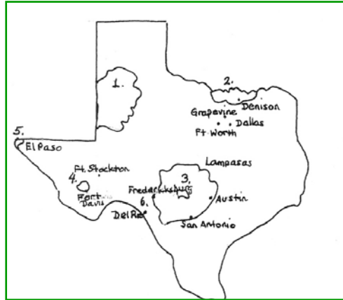
The Winegrowing Regions of Texas