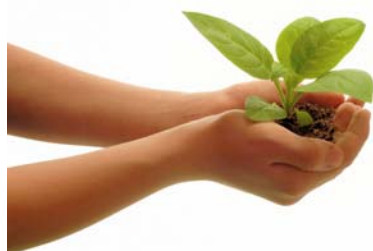
***Artemisia Powys (or Powis) Castle

**Plant these seeds in pots or flats and keep in a relatively cool spot with afternoon shade.