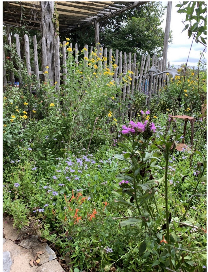
What a small amount of rain and cooler temperatures can do for a pollinator garden.