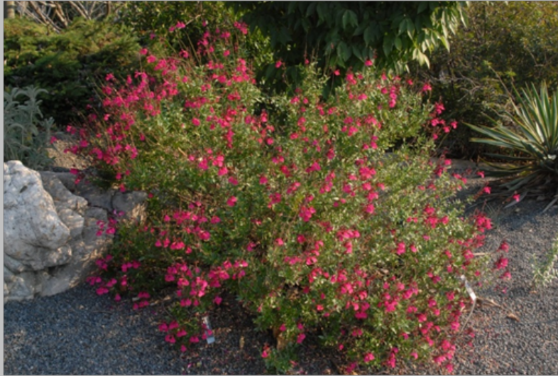
Autumn Sage is a wonderful native plant for all seasons, especially fall.