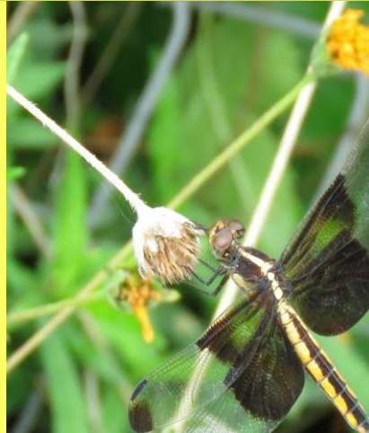
Widow Skimmer (Female)