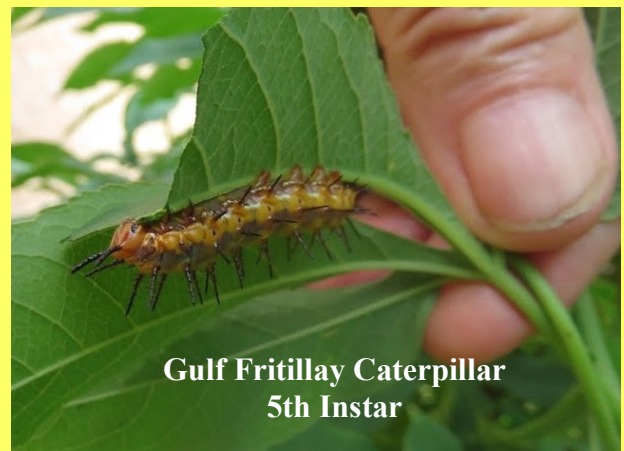
Gulf Fritillay Caterpillar 5th Instar

Update from Demo Garden: Lots of Painted Lady's working the Gold Lantana's (right) and the usual crowd of Queen's (above) on the Blue Mist and Tropical Milkweed.