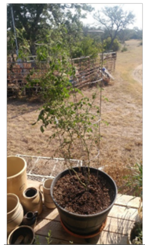
Yellow Pear Tomato

I've been researching how to propagate and graft fruit trees and hope to try a few things