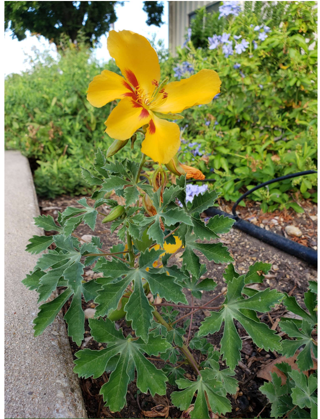
Wright's Yellow Show

This little cutie thrives in full sun, but it wants regular watering. In the fall the stem dies back to the ground, to be replaced by a new one the following late spring. Our herb garden caregiver, Bee Evans, will surely want one for her demo garden section. It's small 18" height will fit quite comfortably among her surprisingly expansive native and adapted herb section.